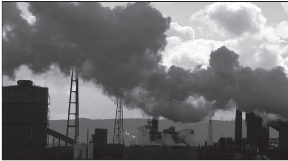
Imperialism is wrecking the planet and must be stopped

Contrast the stirring words of these revolutionary leaders with the spineless action of the Rudd/Gillard Labor Government in bowing to the biggest capitalist polluters and shelving even